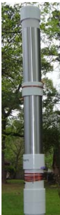
20M EH built with 2" PVC pipe

Information and data for this page is from documentation obtained from the EH Antenna web site and from my own experience with building these antennas.